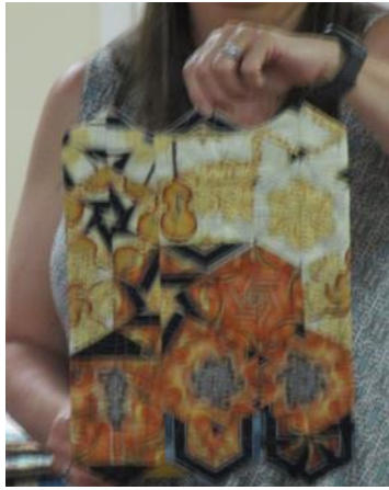
June Taylor Quilt By Number bag Sophie

Mini one block wonder entitled Music Memories