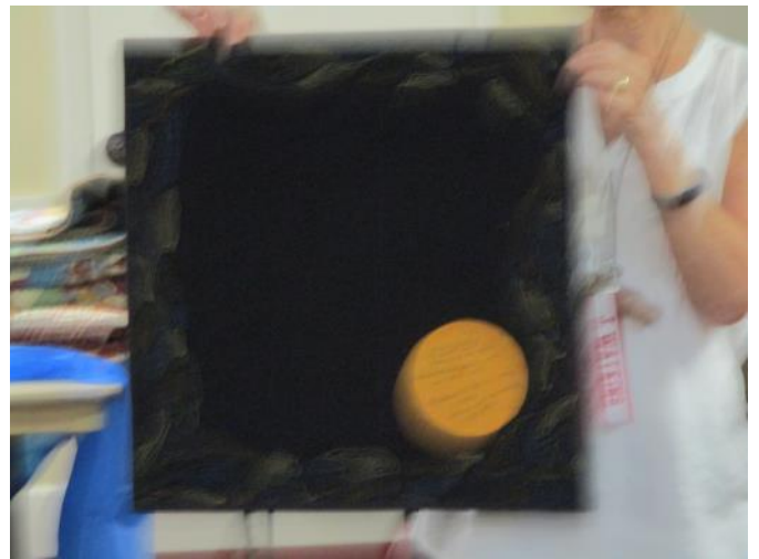
Quilting on back of this quilt.