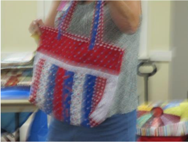
Jumping Jacks by Sweet Jane's Quilting & Design entitled Tuesday Morning Garden