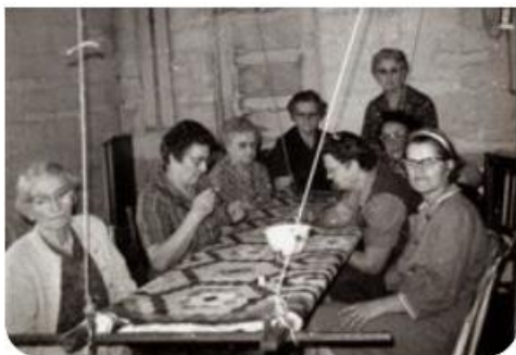
Curious about our area quilt history? Yes, this is an older scene, but basically the same. Like Minds drawn together for a purpose.

Review of the Quilting History in the Central Mississippi Area